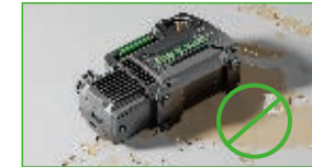
Anti-dumping oil leakage