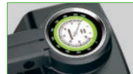
Overhead vacuum gauge