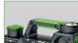
Li-ion battery powered