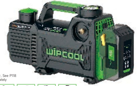
Battery Adapter. See P118 Available separately